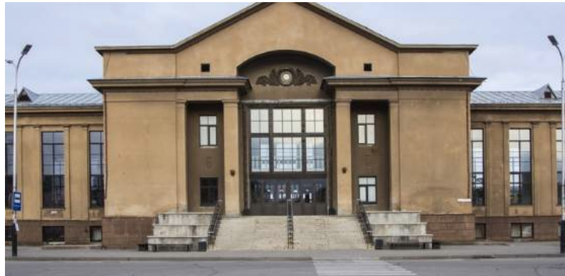
Attēls Nr. 1 Daugavpils TRAIN station

You will need to use Tram Nr.1 and Tram Nr.3 .